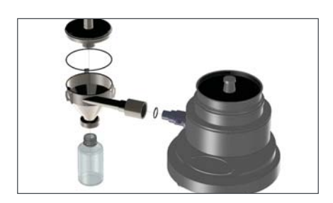
CYCLONE TO RECOVER THE PRODUCT