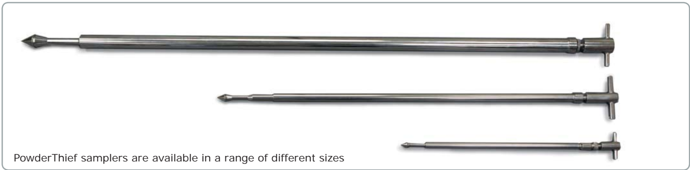
PowderThief samplers are available in a range of different sizes