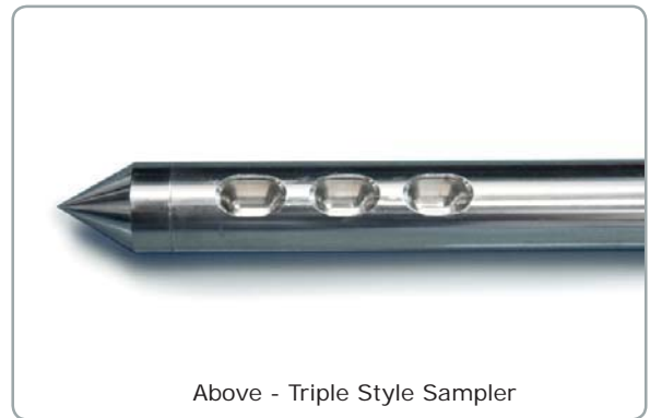
Above - Triple Style Sampler