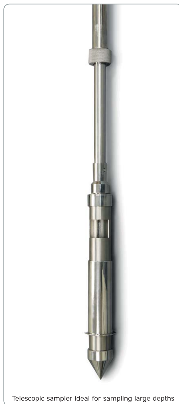
Telescopic sampler ideal for sampling large depths